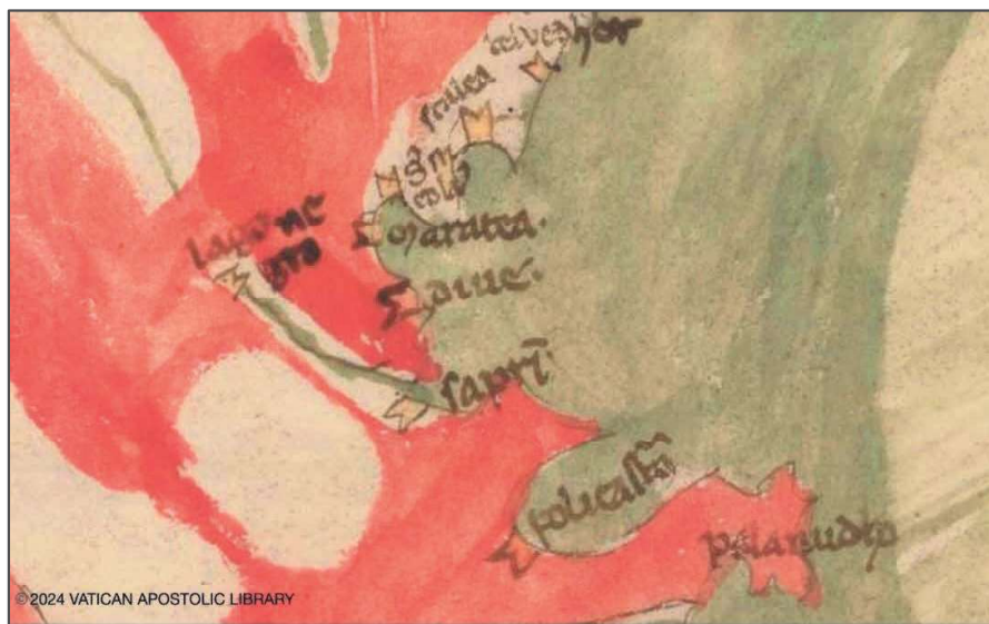
Figure 4. The Tyrrhenian coast of Lucania in the Codex Vat.Lat. 1960 (south-up map orientation).

places, thus produced an extraordinary toponymic system, which proliferated both along the temporal axis (on the diachronic plane) and along the spatial axis (by reproducing itself in other places). The presence of two different references to this site ( Cessarnia and Cesernia-Veneris ) in the Unknown Ravennese (7th century), which are repeated by Guido of Pisa (12th century), can at this point be interpreted as a snapshot of the moment when the memory of Caesar began to fade, flanked (and then, as we shall see, replaced) by the reference to Venus Genetrix during the Middle Ages, which occurred gradually and in a very particular way. This interpretation is confirmed based on the analysis of one of the oldest chorographic maps of Italy that has survived to this day, which was drawn on parchment by the Franciscan monk Paolino da Venezia in the first half of the 14th century (Codex Vat.Lat.1960, 286r; detail shown in Figure 4).