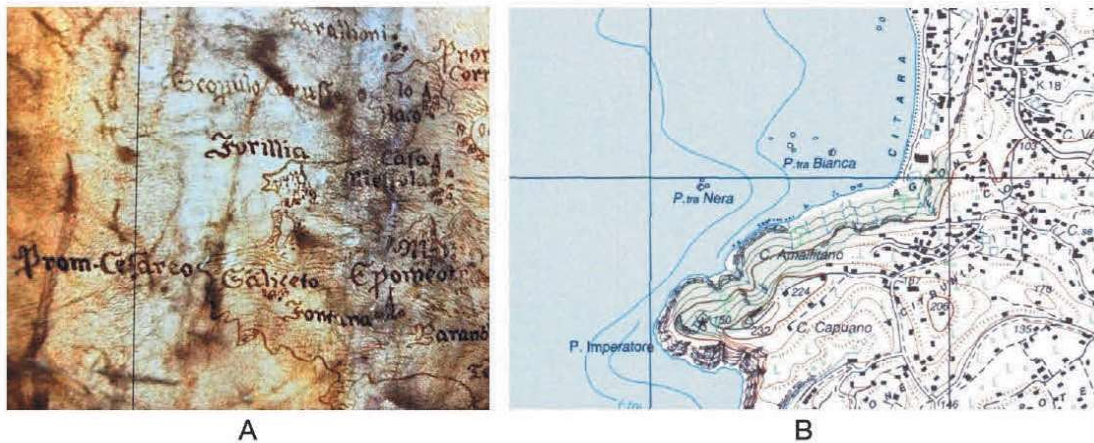
Figure 3. Punta Imperatore (island of Ischia ) on both the Aragonese Map (A) and in modern cartography (B). Figure 3A is reproduced with permission of Bibliothèque Nationale de France

map), beyond Citara beach , appears to be marked as Prom. Cesareo (Figure 3A) instead of the modern toponym Punta Imperatore (Figure 3B) (La Greca 2023, 43, 218-219). This toponymic alternation (i.e., the change from referring to Caesar to referring to the Emperor) is once again easily justified by the fact that Octavian himself was a frequent visitor to the Campanian archipelago (Di Franco 2022). The presence of the toponym Citara in those same localities of Ischia is thus clearly traceable to the appellation of Venus Cytherean (born on the island of Cythera ). Thus, the toponym Santa Venere of the not-too-distant Lucanian coast is proposed once again, albeit with a slight variation. The finding of similar toponymic outcomes that result from similar motivations for naming and, moreover, are subject to the same diachronic evolutions in two different places represents the 'litmus test' that reveals that the initial methodological assumption made in the present study, i.e., identifying Caesariana with Cesernia/Ceserina and placing it on the coast, was correct.