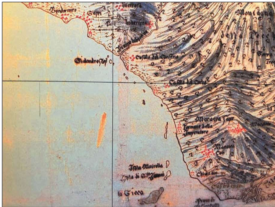
Figure 2. The Torriane dello Imperatore , located between Sapri and Maratea , as shown on the Aragonese Map. Naples State Archive, Iconographic Office 64 (formerly Farnese Archive, 2114, no. 1).

However, an examination of the toponymic context of that area and its diachronic evolution revealed that, at the locality of Santa Venere [ St Venus ] of Maratea , the medieval coastal tower present there ( Torre Santa Venere ) was shown on a 15th-century Aragonese map as Torriane dello Imperatore [ Emperor's Tower ] (Figure 2) (La Greca 2023, 121). This fact immediately highlighted this place, since it was precisely the emperor Gaius Julius Caesar Octavian Augustus, nephew and testamentary heir of Julius Caesar, who had been the main promoter of the cult of Venus, progenitor of the Gens Julia , with the propagandistic aim of reinforcing the myth of the divine origin of his family, his power and Rome itself (Aparicio 2013). Beginning in 27 BC, the attribution divi filius [ son of the divine ] appeared on all coins and epigraphs commemorating him (Menichetti 2018).