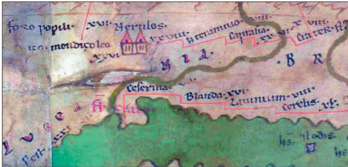
Figure 1. Fragment of segment VI B of the Tabula Peutingeriana, depicting the Lucanian Tyrrhenian coast near Nerulum ( Nerulos ) (source: https://tp-online.ku.de/treffer_it.php )

Unfortunately, while Nerulum also appears with this precise name in other sources (Liv. 9.20.9; Suet. Aug. 4.2), thus confirming the exact toponym, this coastal statio is not mentioned elsewhere. Notably, a very similar toponym, Caesariana , is mentioned in the same area in another itinerary, namely, the Itinerary of Antoninus. Among those mentioned, this itinerary source is the oldest (Adams & Laurence 2005, 22) as well as the one that correctly reports the place name Nerulum (Parthney & Pinder 1848, 50). However, with regard to the reliability of topographical information, the Itinerary of Antoninus has already been proven to be deficient, as is the case elsewhere in the Roman Empire (Greco 2020, 25-29; Fodorean 2017; Fodorean 2015; Wheeler 1920). In fact, although it always places Caesariana in the immediate vicinity of Nerulum 1 the Itinerary does not report this statio along the coastline but rather along the inland road leading from Capua to Reggio Calabria . Many topographers have obviously already assumed that such similar toponymic forms must all refer to a single settlement (Romanelli 1815, 24, 379, 394-395; Guandalini 2001, 221-222), but these differences have undoubtedly hindered the precise identification of its location, as research has not been able to make full use of the information provided by the toponymic element. Table 1 presents the sites where Caesariana has hitherto been proposed to be located.